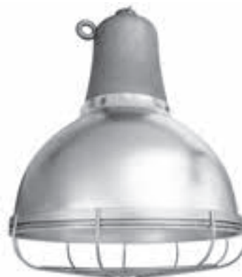
Outdoor Metal Halide Crane Lights