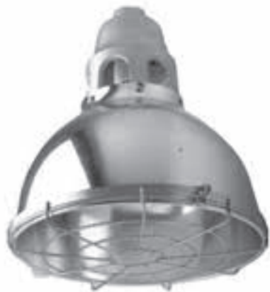
Indoor Metal Halide Crane Lights