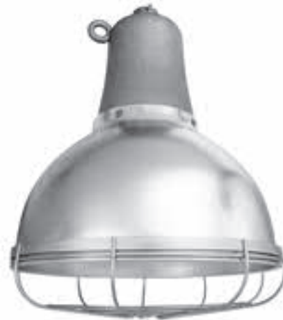
Outdoor Crane Lights